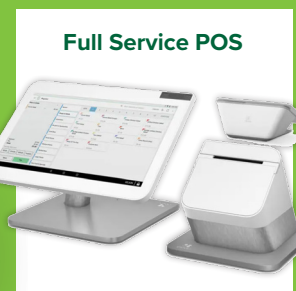
Full Service POS